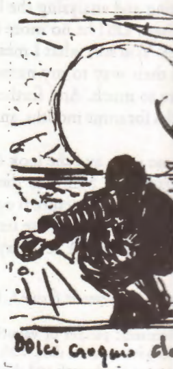
Vincent van Gogh, sketch letter to Theo, end of October

However hateful painting times we are living in, if any zealously, he is a man of duty, wretchedly difficult at times, he work. I believe that even Gauguin develop his powers, although it absolute lack of models. But on have just done five size 30 canvases here is that my health is improving but that is because I am trying to and I'm afraid abstractions would